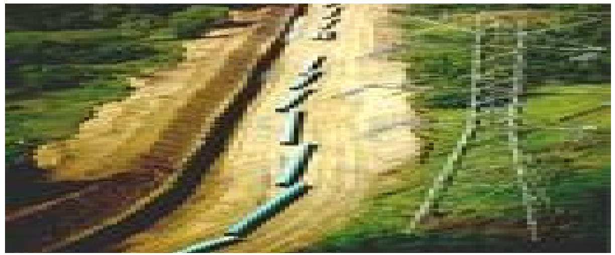
Figure 3.2 showing new pipe line construction site

Sarir project have team to design a new site through professional service of creating and developing concepts and specifications that optimize the function, value and appearance of products and systems for the mutual benefit of both user and manufacturer. In designing the location, Sarir determine suitable plant location for interrupted operation and maintaining pipelines and safety fig 3.2. Factors influence the effectiveness of the plantlocation are near to oil field, employee, material handling, strategic objectives, and socio economic factors. The eeffective plant location factors will achieve various objectives like efficient utilization of available land space, minimizes cost, allows flexibility of operation, provides for employees convenience, improves productivity etc. The entrepreneurs must possess the expertise to lay down a proper layout for new or existing plants. It differs from one plant to another. But basic principles to be followed are more or less same. Although, this report is mainly conducted with Sirir Gas turbine in main but it is applicable to all types of industries or plants.