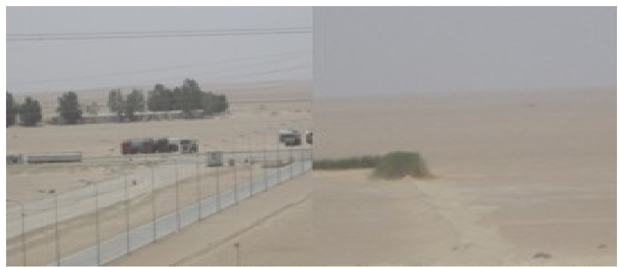
Figure 3.5 Showing the desrt area of the company

This type of problem ranges from a simple facility location problem where the only decision made is where to establish a new plant, to more complex problems that decide on several aspects at the same timefigure 3.5, such as inventory, demand allocation, reliability, routes and others. The company transportation factors have been considered as inputs to several types of models serving as a multiplying weight; however, these factors have not been considered as decisions. Some of the factors related to the complex concept of transportation are: availability and reliability of diverse transportation modes and infrastructure; existing capacity in links, nodes and transportation modes; reduction of transit times for each transportation mode; maximization of transportation resources utilization; improvement of routing and scheduling performance; climate; community culture; regulations and quality standards; and others, along with the more traditional factors of distance, demand, and cost. the regular monthly fuel consumption is high and to keep this smooth is very difficult and this is provided in the summary.