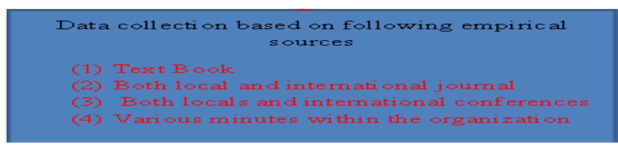
Figure 1 outline of research methodology

The outline of research methodology for this report is presented in the form of a chart given in figure 1. The highly competitive environment, linked to the globalization phenomena, demands from companies more agility, better performance and the constant search for cost reduction. The present studyfocused onthe analysis of plant location effectiveness on the study of Sarir Gas Turbine 855 MW Project Site at General Electric Company of Libya. The Materials are among many factors that contribute to improve a company's performance. The report is related in this work was performed in Sarir Gas Turbine 855 MW Project Site at General Electric Company of Libya. It was founded in the recent years and is classified as large-sized companies that provide electricity to Libya. The Sarir region contains a cluster of industries of metal-mechanic, automotive and metallurgical sectors that in its majority belong to production chains which demand a high internal performance level from their partners so the gas turbine is one them.