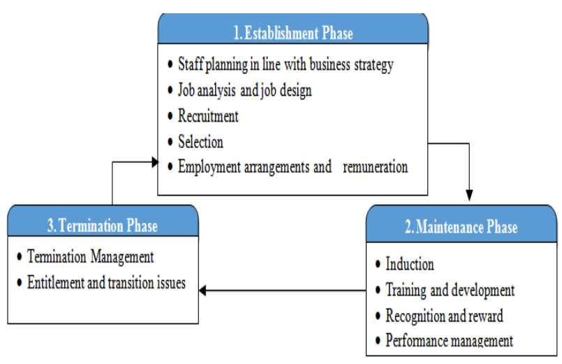
Figure 1. Employment Cycle

Human Resource Management is the process of recruitment, selection of employee, providing proper orientation and induction, providing proper training and the developing skills, assessment of employee (performance of appraisal), providing proper compensation and benefits, motivating, maintaining proper relations with labor and with trade unions, maintaining employee's safety, welfare and health by complying with labor laws of concern state or country. Many great scholars had defined human resource management in different ways and with different words, but the core meaning of the human resource management deals with how to manage people or employees in the organization [1]. The employment cycle involves an organization determining its employment needs in line with its business strategy. Once employees are established, it's time to hire staff. Once staffs are employed, steps need to be taken to ensure employees are satisfied and productive. The final phase of the cycle is managing what happens when employees leave the organization. These three phases of the employment cycle are summarized in the following diagram.