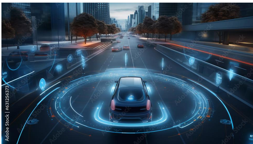
Figure 2: A sneak peek into how the world looks for an autonomous software like Agentic AI operating in a car

Had traditional AI been used, cameras and sensors would simply have relayed the information- the software would have lacked the technological capabilities to autonomously respond to the information and take proactive steps. Moreover, limited adaptability of these systems would have led to their failure when new circumstances-other than the ones practiced in training- would have been encountered. This would significantly possess a safety hazard, as the inability to detect a change of lane and keep the vehicle in the specified lane, for example, would lead to potentially serious accidents on the road 4 .