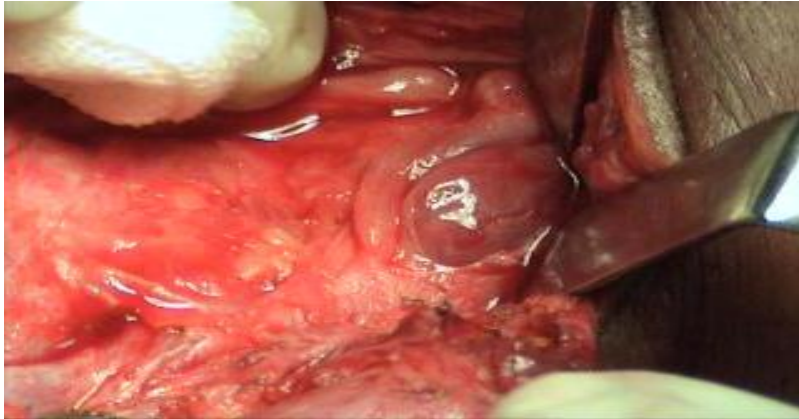
Fig.2 Operative photograph showing right inferior parathyroid adenoma