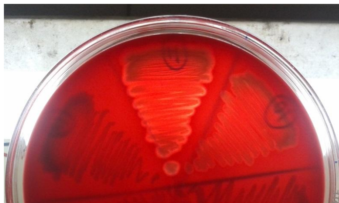
Figure 4: Beta haemolysis on 5 % sheep blood agar.