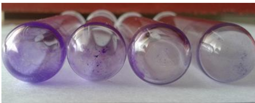
Figure 1: Biofilm production – Tube method.