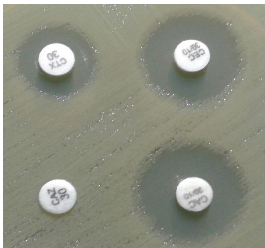
Figure 3: ESBL detection - CLSI phenotypic confirmation test.