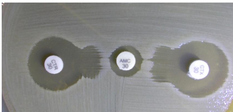
Figure 2: ESBL detection – Double disk synergy test.