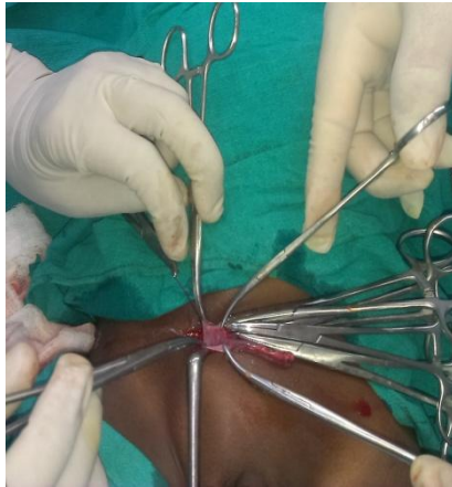
Conventional Open herniotomy

Followed up: Patients were followed up for an average of 4 months to evaluate these outcomes.