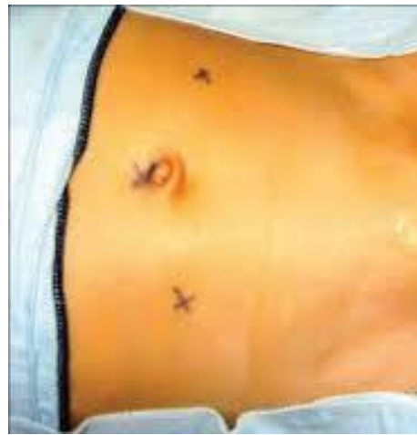
Post op Scars in Laparoscopy