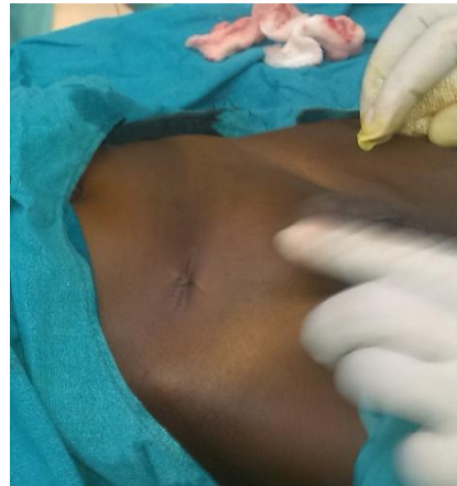
Post operative Scar in Open herniotomy