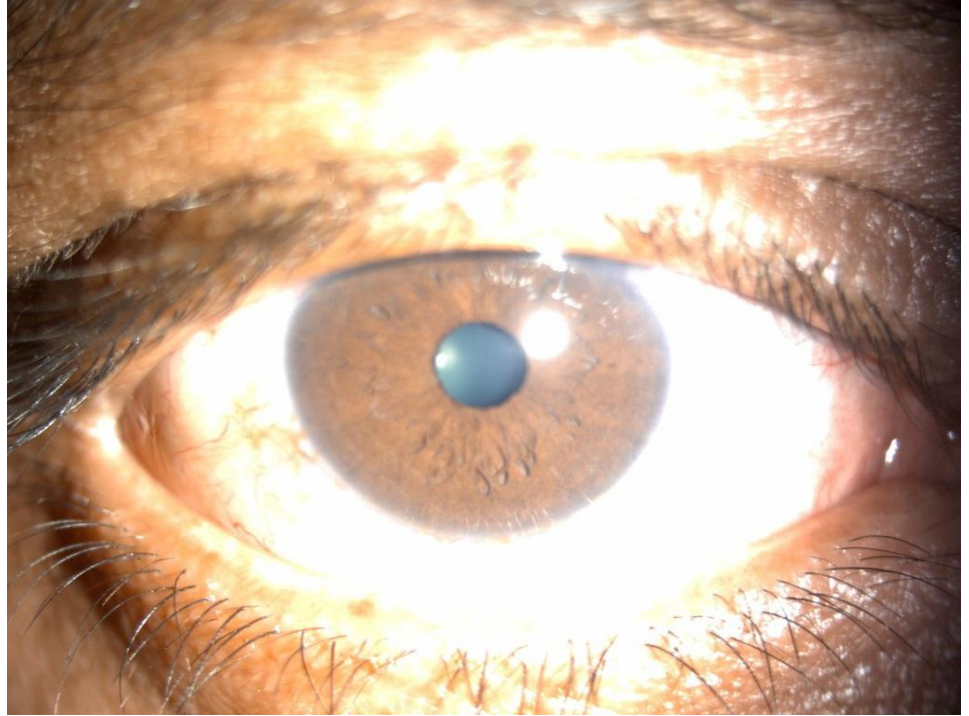
Figure 4: Complete resolution at 6 weeks follow up.

DrBhargavi Lakshmi Kanakamedala "Role of topical Mitomycin c in the treatment of placoid variant of Ocular surface squamous neoplasia.-A Case report."IOSR Journal of Dental and Medical Sciences (IOSR-JDMS), vol. 17, no. 6, 2018, pp 01-04.