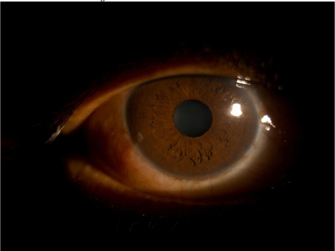
Figure2: After 4weeks treatment with MMC