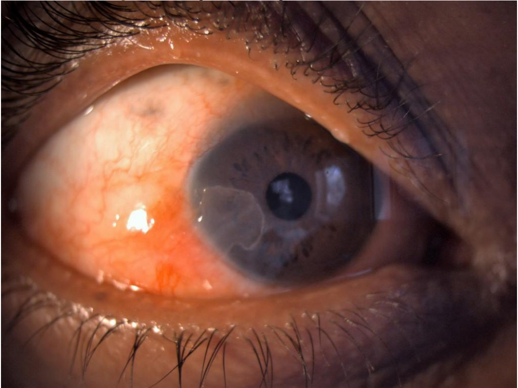
Figure1: Patient presented with placoid variant of OSSN