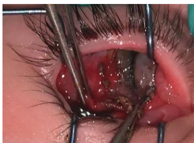
Fig 1 : Conjunctival Pigmentation And Necrosis After Removing The Battery Button

The patient was treated with topical antibiotics and steroids for one month, and the symblepharon ring was removed after three months (Figure 3), with a final best visual acuity of 7/10.