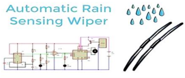
Fig. 1. Circuit diagram

Rain Intensity Detection: The rain sensor measures the intensity of rainfall, which can be represented as: I_r = f(S_r) where I_r is the rain intensity and S_r is the sensor's output signal.