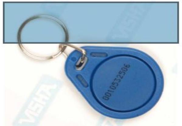
Figure 3: EM4001 RFID Tag

This is a basic RFID Tag Card used for presence sensing, Access Control etc. Works in the 125 kHz RF range. These tags come with a unique 32-bit ID and are not re-programmable. It is EM4001 ISO based RFID IC, consists of 125kHz carrier and supports 2kbps ASK and Manchester encoding. The 64-bit data stream consists of Header +ID + Data + parity.