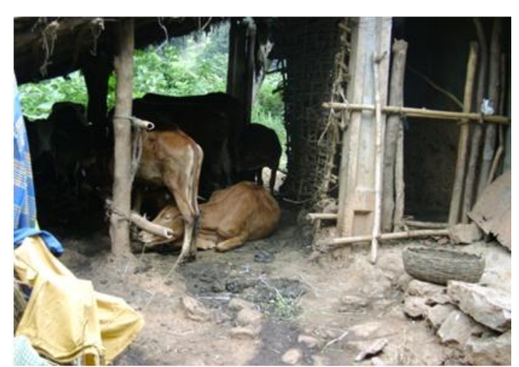
Fig. 1: A Cattle shed attached to house.