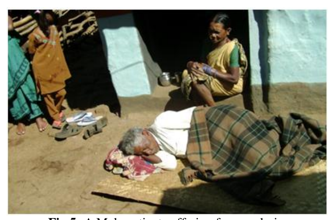
Fig 5: A Male patient suffering from malaria.