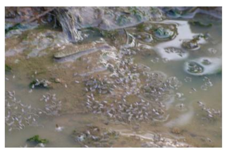
Fig. 2: Mosquitoes larvae and adults are in urinary pits of the cattle.